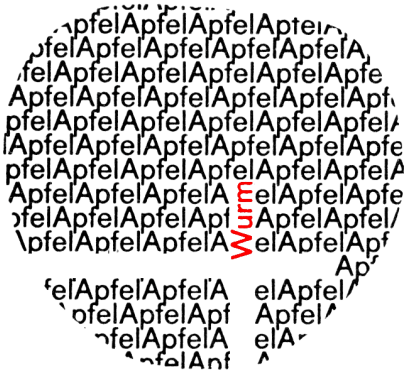
fig. Still from: "worm applepie for doehl", 1997

In 1997, I created a computer animation of Döhl's concrete poem as "worm applepie for doehl," 3 in which the word worm eats up the apple picture, and thus sated, slowly digests itself back to its original size, only to start eating again. Admittedly, the "worm applepie" can perhaps still be seen as kinetic art or film, but the next step in the evolution of the "apfel" as a "codework" clearly has a